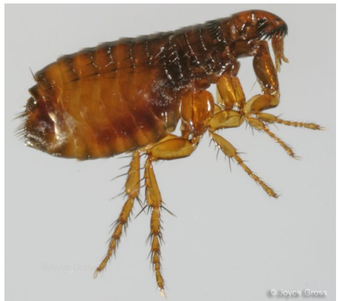
Cat flea

Control of fleas involves killing adults on infested pets, and destroying eggs, larvae and adults in bedding, carpets, and furniture. This could involve treating both the pet and home simultaneously with insecticides, and frequent washing of bedding and keeping carpets as clean as possible. Infested furniture, such as couches or overstuffed chairs should be discarded. Adults can live for long periods of time without feeding, particularly at cold temperatures. It should be noted that there is little evidence that feeding pets yeast, vitamin B12 or garlic will prevent flea infestations. However, there are topical, systemic treatments for pets that are very effective against fleas.